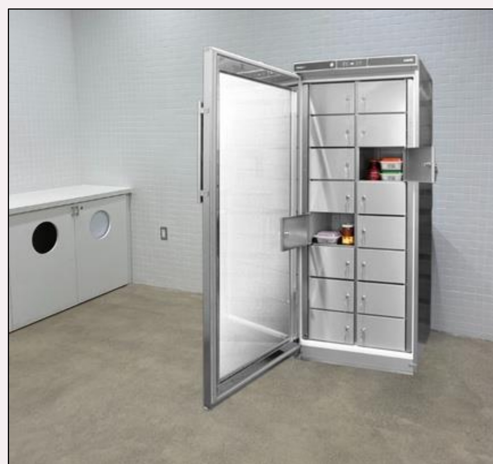
Fridgie in The Hub (student life building), next to microwaves